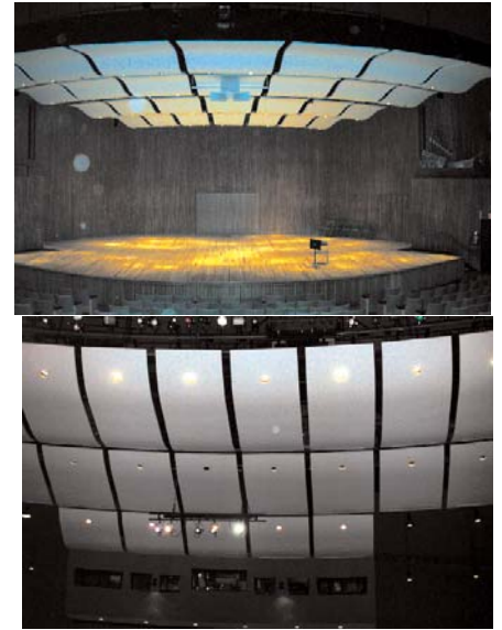
Figure 3. Kresge Auditorium MIT, Boston, MA. Top: Stage canopy. Bottom: Audience clouds.

Kresge Auditorium was designed by the late Eero Saarinen and built in the 1950s. Admired as it was for its clean lines, the design posed a serious challenge to BBN, the acoustical consultants. Employing arrays of panels to direct sound away from the curved ceiling, they successfully neutralized the auditorium's less than favorable geometry. However, over time, the