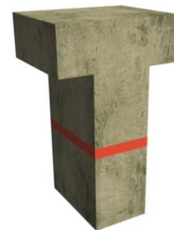
Decoupling of walls and beams