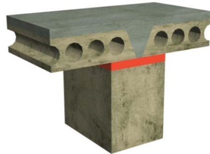
Decoupling of floor segments