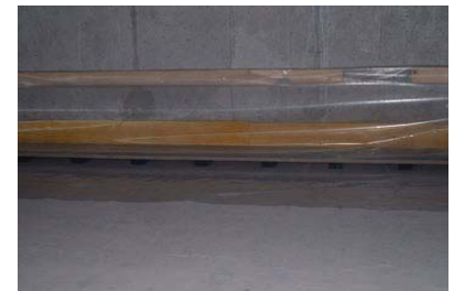
beam under wall

The resonance frequency of the pads under the wall strip was expected to be around 8-10 Hz. Special care was to be taken for a 78.74 ft long and 34.77 ft high wall section. This part was only in contact with perpendicular walls at the ends, and no additional stiffening against bending was foreseen. Furthermore, cantilevers were fixed to this wall at 19.68 ft height to hold heavy curtains for room acoustical purposes, imposing extra momentum on the slim structure. With all that in mind, the necessity of resilient wall hangers connecting the block work wall to the structural in a horizontal sense was realized early in the planning procedure.